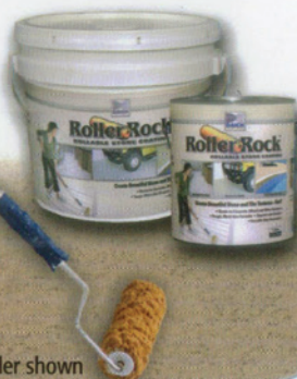
*Stone Texture Roller shown