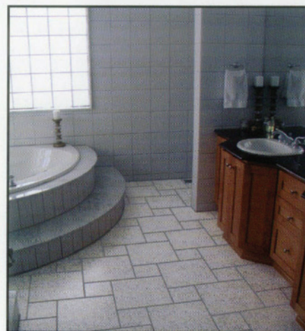
Installed with Tile Texture Roller